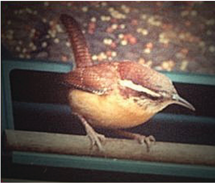
Figure 2. Carolina Wren ( Thryothorus ludovicianus )

“Scale” essentially means the size of an area. When a bird “responds to” an area, it is attracted to that area and the landscape structures within it. “ Landscape structures ” are the actual objects (such as trees, bushes, fields) within a given area.