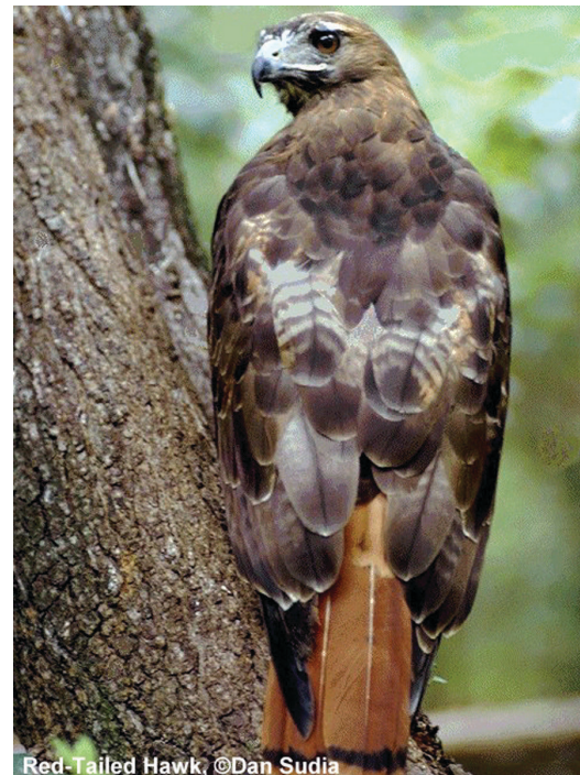
Red-Tailed Hawk, ©Dan Sudia Figure 1. Red-tailed Hawk ( Buteo jamaicensis ). Credits: Dan Sudia.

selecting a particular area? Why would a bird select one yard versus another yard?